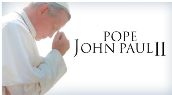
Pope John Paul II

To sign up, follow this link https://shorturl.at/iDzAF . Type your email address and use 64628 to find Immaculate Conception, Brookfield as our "Parish". Once you have signed up, you can use the apps for formed on your phones, TVs, or online!